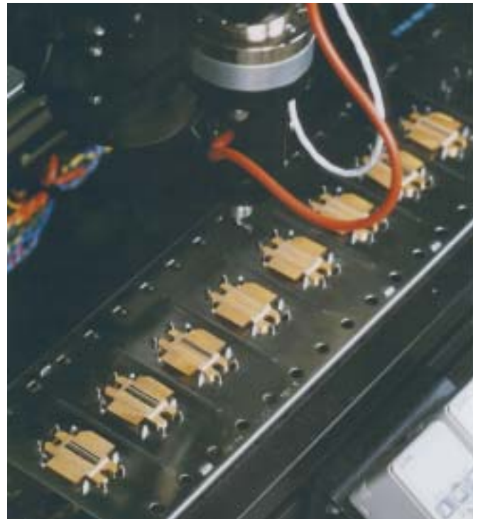
Figure 4. Conveyorized eutectic bonding for high power devices.

requirements. In these cases, the dispense system must have multiple pump capability, and, ideally, easy changeover between multiple pumps or a pump and stamping head pair. Flexibility is achieved when the pumps and stamping tools are attached with a common mount and can be changed over quickly.