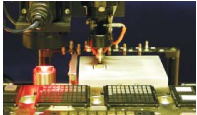
Figure 1. Die and other components require precise and repeatable placement to avoid the need for post-test tuning.

Materials presentation is key to achieving high yields because component handling must be limited. For example, automated systems should accept all material input types, such as wafer or gel-paks, wafer and tape-and-reel, to avoid the manual transfer of parts (Figure 2). Material handling involves processing boats, custom carriers and lead frames. Using these tools allows for standardization across a line and avoids man-